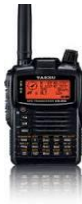
Yaesu FT1DR C4FM FDMA/FM 144/430 MHz DUAL BAND TRANSCEIVER