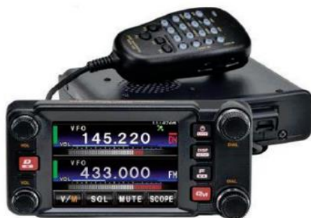
Yaesu FTM-400DR/DE C4FM FDMA/FM 144/430 MHz 50 DUAL BAND TRANSCEIVER