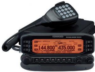
Kenwood-TM-D710A APRS / TNC / GPS / Echolink Ready 2M/440 FM Transceiver