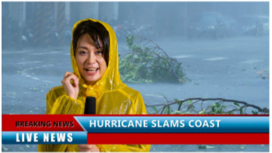
A Meteorologist Reporting Dangerous Weather

Do you sometimes have dangerous weather in your area? People across the U.S. may experience dangerous weather and need to be prepared. September is National Preparedness Month. A National Weather Service program called Weather-Ready Nation helps people prepare for dangerous weather. Weather-Ready Nation has a website that includes information, pictures and videos. People can use the website to learn about dangerous weather that could be nearby. They can learn how to prepare for this weather too. Being prepared can help people be safe!