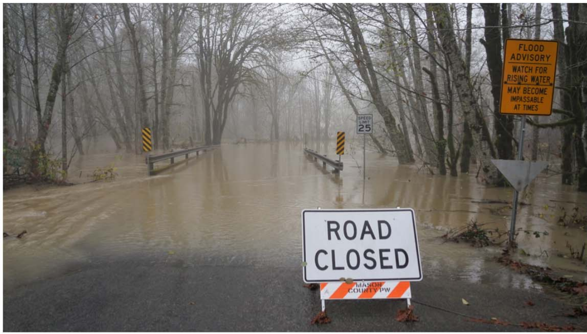
A Flooded Road

Dangerous weather can affect everyone. It can hurt people and destroy buildings! The most common kinds of dangerous weather are flooding, lightning, fog, wind and extremely hot or cold temperatures. You can talk to your parents and teachers about what to do at home and school during dangerous weather. This week's News-2-You<sup>®</sup> Extension Activity, located on the main web page, can help too. It has information about being prepared, and explains helpful phrases like "when thunder roars, go indoors" and "turn around, don't drown." These phrases remind you of ways to stay safe. Click on the Weather-Ready Nation website link below to learn much more!