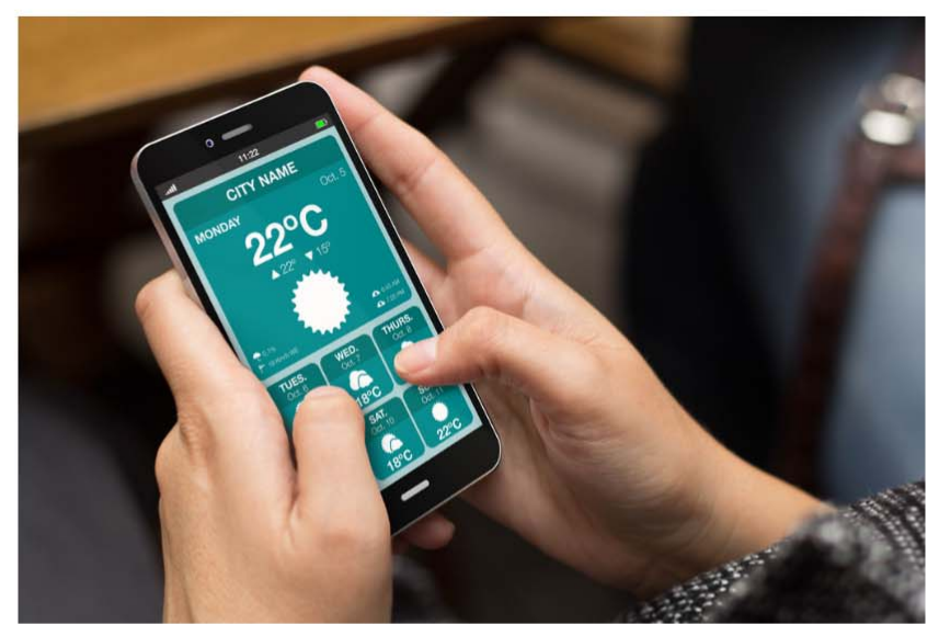
A Weather Report on a Smartphone

The National Weather Service is a government group that studies weather. The group informs people about weather and helps them prepare. Scientists called meteorologists work for the National Weather Service. Meteorologists use satellites in space and other tools to study weather. Meteorologists report what weather is coming to different areas. Some meteorologists give weather reports on TV or radio. People can listen to these reports and know what weather to expect. People can use their smartphones, tablets and computers to look at weather reports on National Weather Service websites and apps. The website below can help you learn about weather in your area.