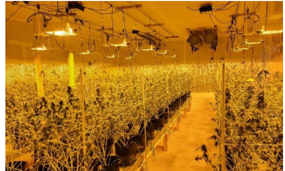
Indoor Marijuana Grow Operation

In 2021, the Sheriff’s Office applied for and received a grant from the criminal justice commission to focus on illicit marijuana cultivation and sale. Partnering with the Yamhill County Sheriff’s Office on this grant, each office has provided a detective to the regional issues of organized crime and drug trafficking organizations surrounding marijuana. The grant covers salary and benefits of 2 employees (1 x Polk & 1 x Yamhill).