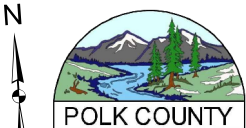
Figure: 4, Page: 6-5

Projection: Oregon North State Plane NAD 83/HARN