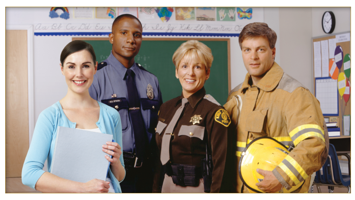
The information contained in this publication is a result of a partnership of agencies working together to provide you with information about conducting drills not only for fire but for earthquake, hazardous materials release, lockdown and lockout.